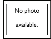
December: Janice Pace